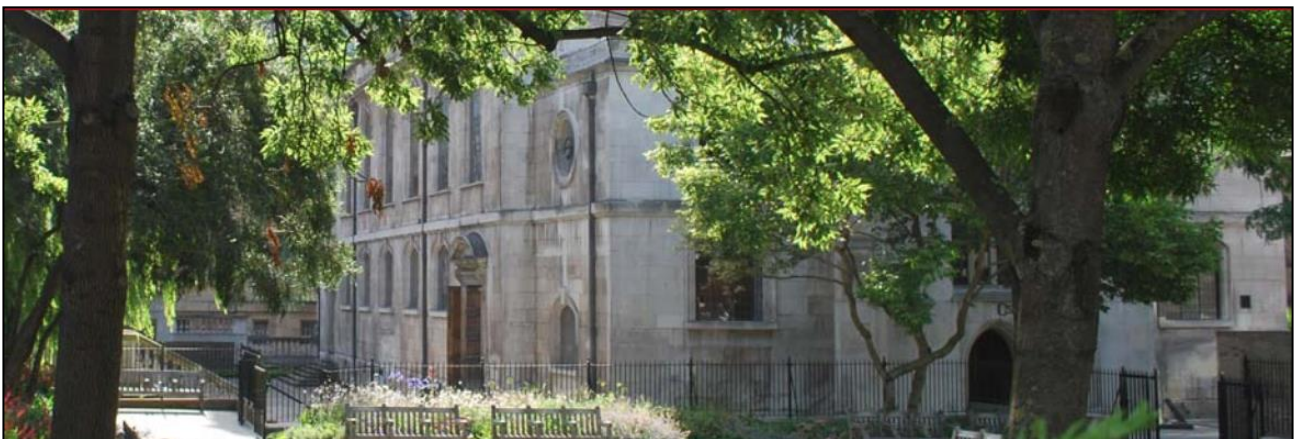
St Andrew's Holborn